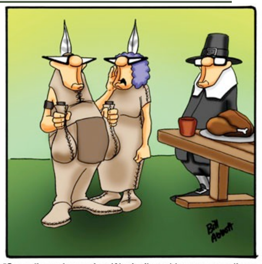
"Serve them cheap wine. We don't want to encourage these people to stay."