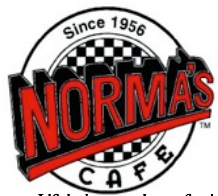
Life is short, eat dessert first!